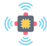
Internet of things